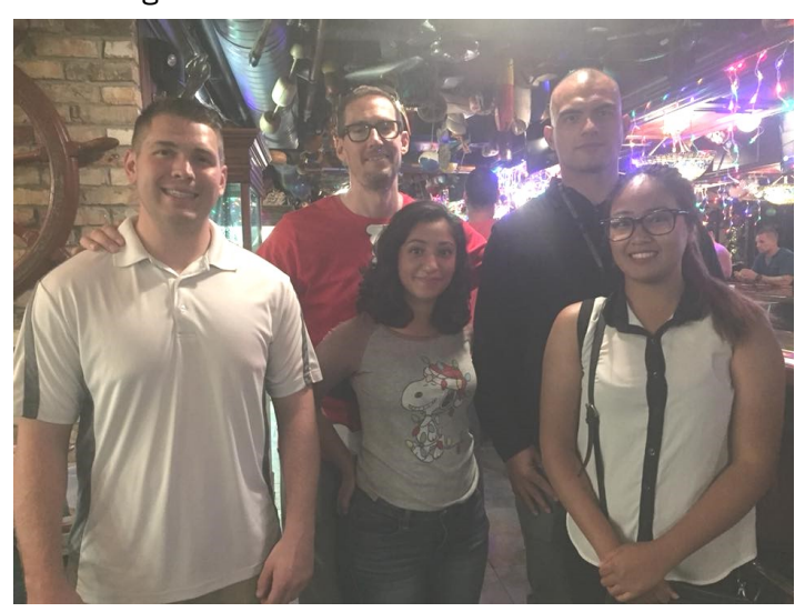
USCGC Robert Yered crew members