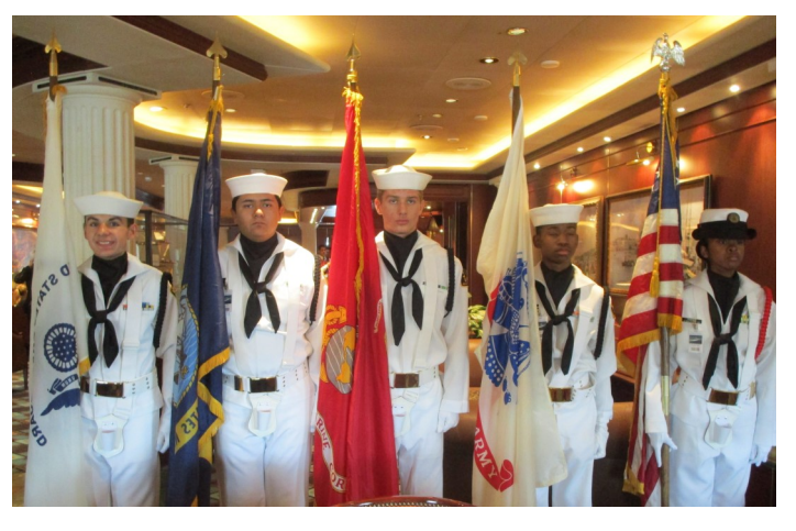
Spruance Division Sea Cadets