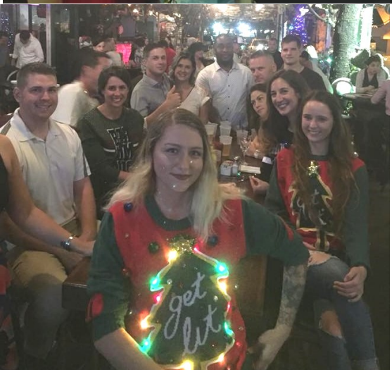
CO of the U S C G C Margaret Norvell and members of the crew