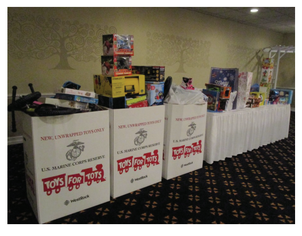
Toys lots of toys!