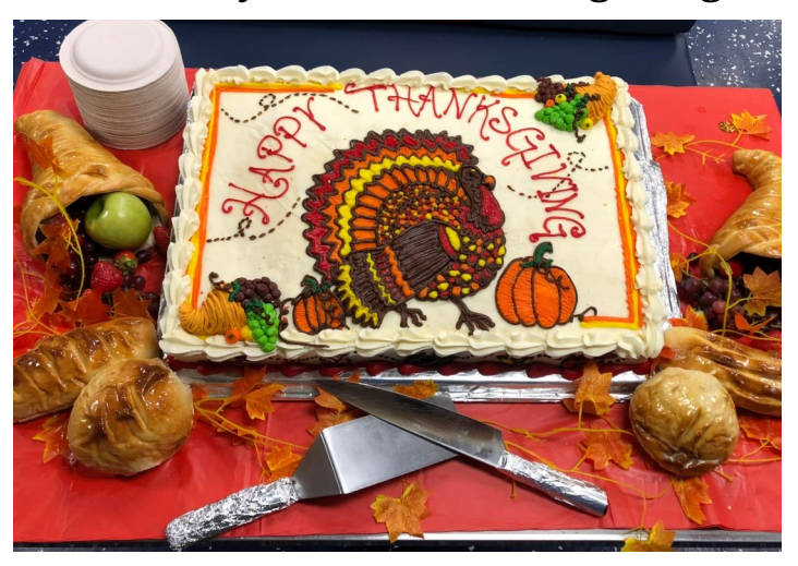
Check out what the Culinary specialists on the USS Leyte Gulf whipped up for Thanksgiving