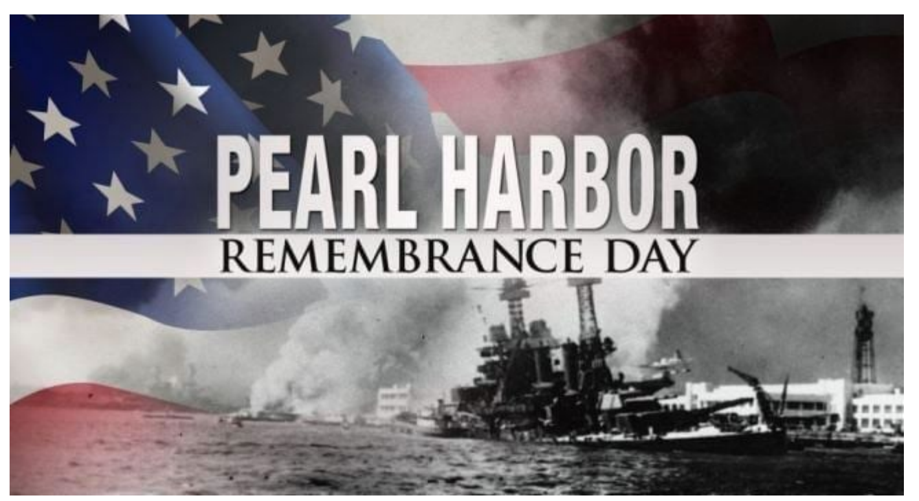
Earlier this month we honored the 2,403 American lives lost on December 7th, 1941. Eighty years after the attack, we remember the heroism of all those who fought and died in defense of our nation.