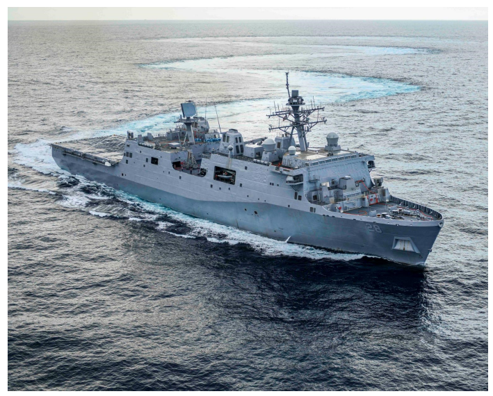
Check out this shot from Huntington Ingalls Industries of the Mighty Fort Lauderdale at sea during Builder's Trials!