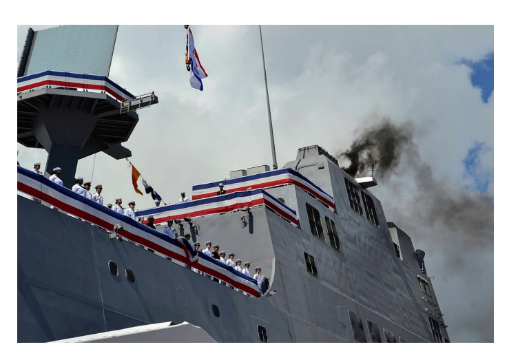
Coming to life...