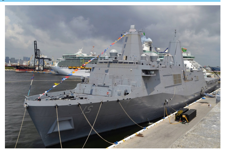
USS New York