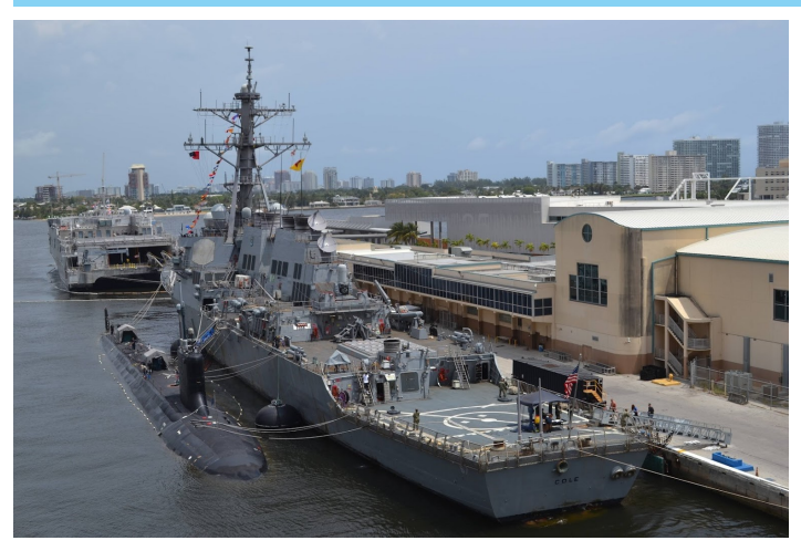
Foreground USS Cole, USS Indiana alongside to port, and the USNS Newport forward of USS Cole