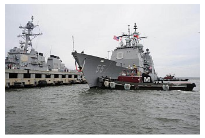
The Ticonderoga-class guided-missile cruiser USS Leyte Gulf (CG 55) returns to homeport at Naval Station Norfolk.

With a new Congress, the Navy is trying again with its proposal to shrink the fleet as part of its "divest to invest" approach.