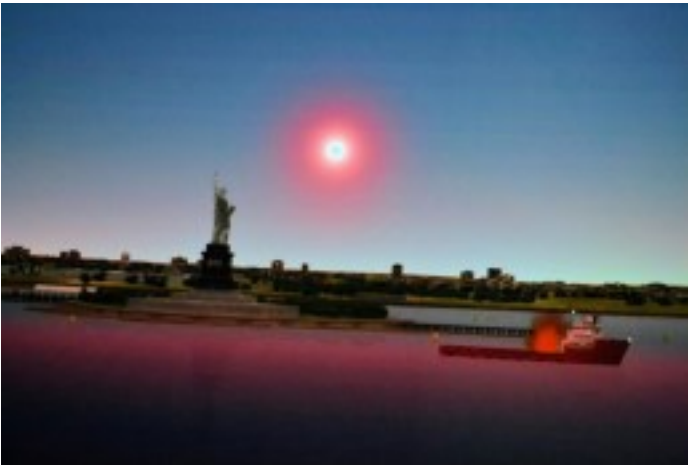
Simulation of a ship on fire near the Statue of Liberty with a flare overhead