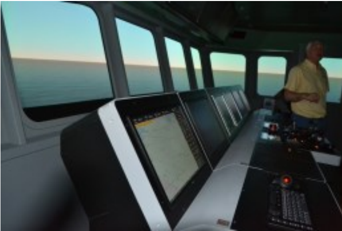
Control console in the simulator room