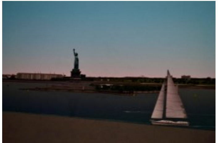
Simulation of a sailboat near the Statue of Liberty from the bridge of a ship