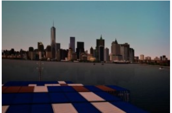
Simulation of a ship entering New York Harbor