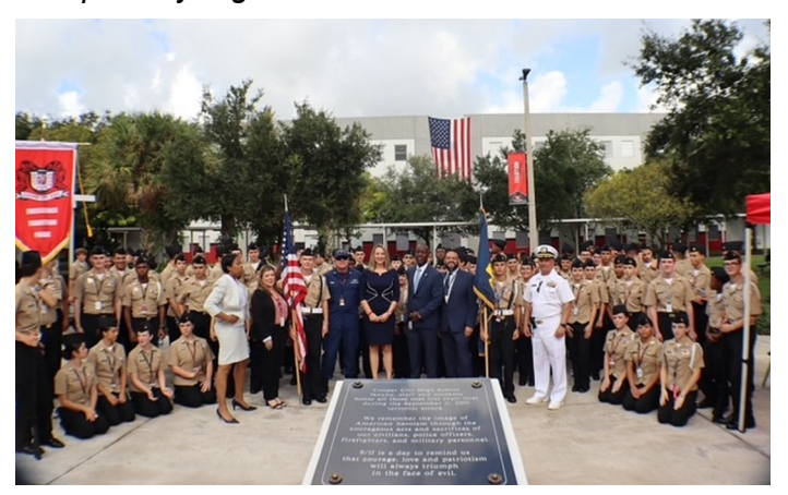
JROTC Cadets and distinguished visitors