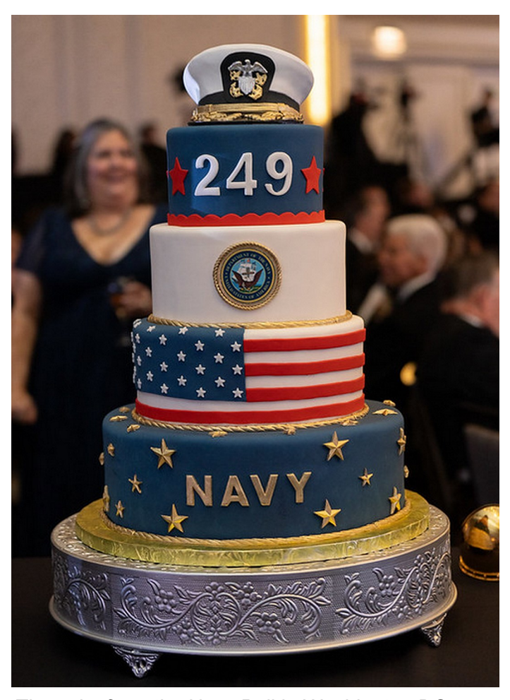
The cake from the Navy Ball in Washington DC