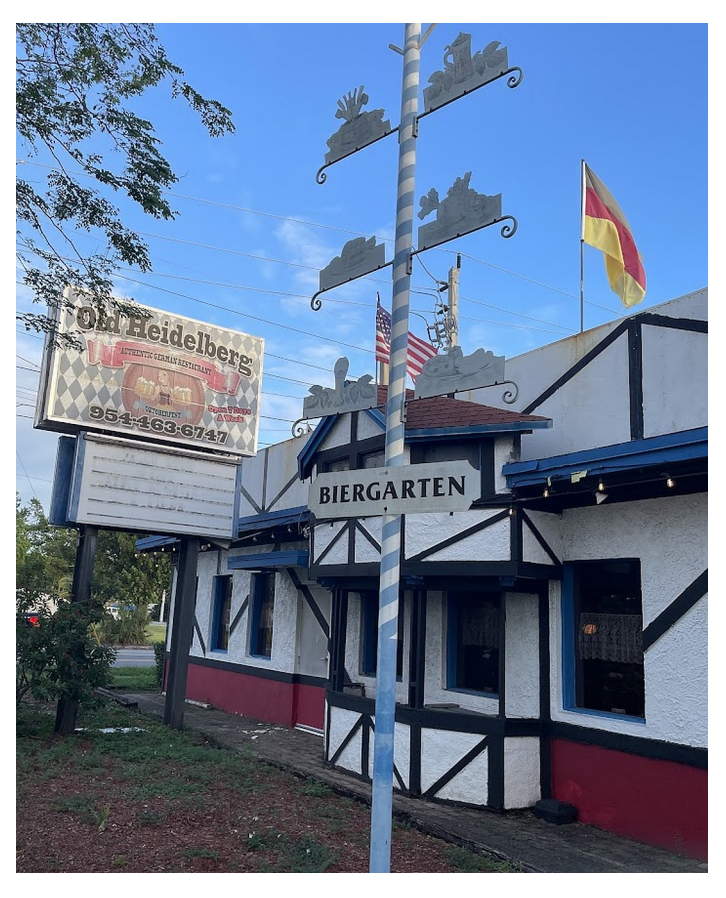
This is a casual gathering where we order off the menu, and is intended to be a time for fellowship with our members and friends. We get there by 6 PM to enjoy the festivities and some great German food and beverages.

A Council tradition has been to gather for a simply social evening at the Old Heidelberg Restaurant on State Route 84 in Fort Lauderdale in observance of Oktoberfest. This year we gathered on Wednesday October 23rd.