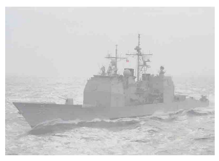
Long time BCNL members may recognize this shot of the USS Leyte Gulf underway

Since her maiden deployment in 1988, the warship has been vital to America's national defense strategy, leading the way in air defense throughout 17 deployments around the world. After decommissioning, the ship will be towed on October 16th to the Navy's Inactive Ship's facility in Philadelphia, Pa., where it will be in a Logistical Support Asset status.