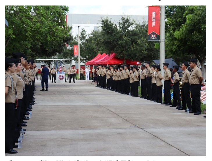
Cooper City High School JROTC cadets