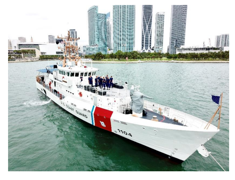
Until we were recalled for a SAR case! Back to puking!