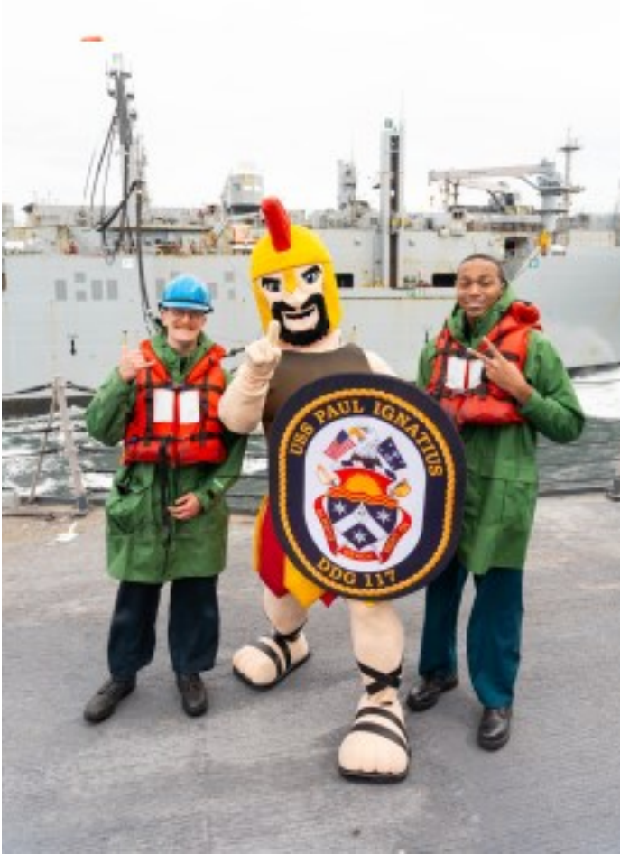
Sailors and mascot on board the Ignatius during an underway replenishment with the USNS William McLean T-AKE-12 in the background

A fact of life for a deployed US warship is that they need to be replenished. More often this is done while underway. This is an evolution that often times can be dangerous, difficult and dirty. But then why not make the most of it and have a little fun as can be seen here.